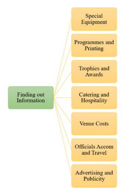
Figure 2.1: Illustrates the Criteria in Budget Development.

Human resources: These include consultation services; they are the qualified individuals with the knowledge and abilities required to finish the tasks listed on the event calendar. People may be hired for the length of the event or they may come from the organization. Consultants that provide a high degree of technical competence not available inside the business or on the local labor market are another example of someone with people skills. The event will create a list of the human resource needs that includes the degree of competence, areas of experience, educational qualifications, and language needs. In order to hire or contract the appropriate employees, this information will be utilized in the resource management process.